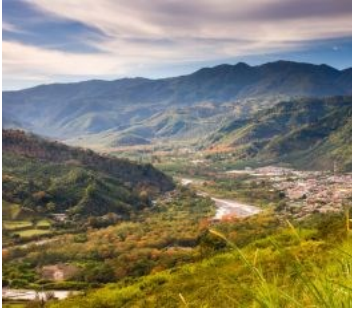
$$$ Irazu Volcano Hike, Orosi Valley & Lankester Botanical Gardens (with Lunch, 9 hrs) - Private