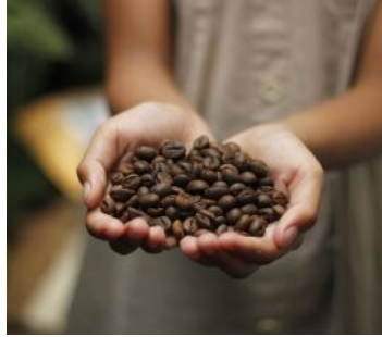
$$$ Don Juan Coffee & Chocolate Tour (with Tastings, 2.5 hrs) - Private