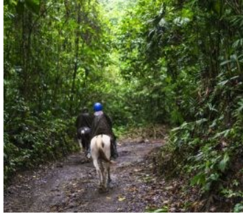
$$$ Don Tobias Horseback Riding (2.5 hrs) - Private