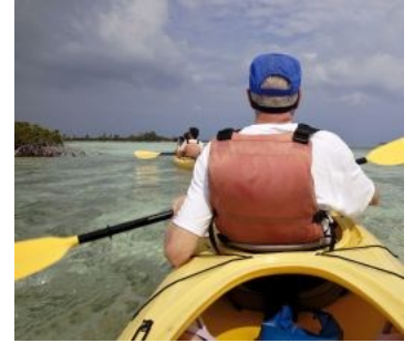
$$$ Damas Island Kayaking (with Lunch, 4 hrs) - Private